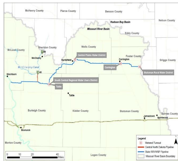
(Overview of the Proposed Central North Dakota Pipeline Project and the State-sponsored Red River Valley Water Supply Project)

25. The Central ND Project will divert twenty cubic feet per second of water—approximately 15,000 acre-feet per year—from the Missouri River via the McClusky Canal, purportedly to provide water for speculative industrial uses to the presumed benefit of North Dakota counties.